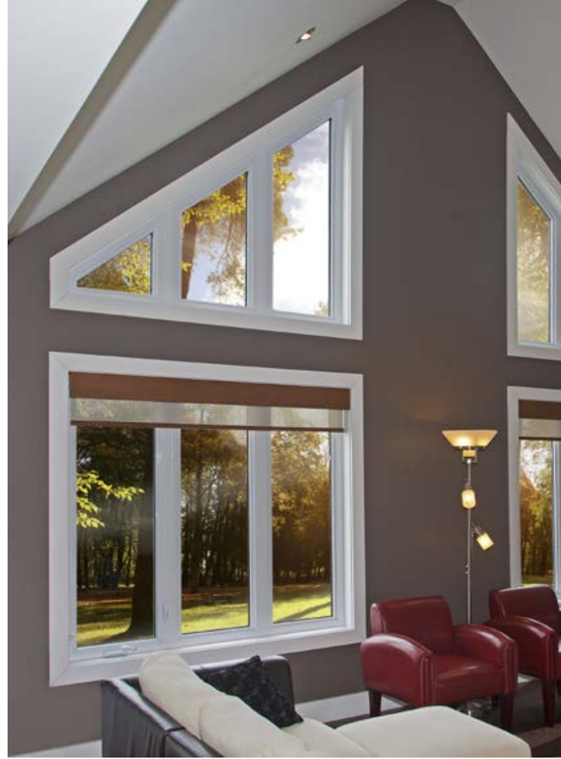
Architectural windows also available.