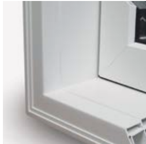
5 3/4" frame including an integrated brick molding