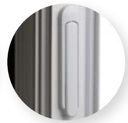
Multi-point Nova Slim locking system