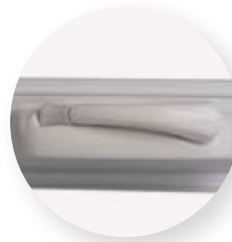
Encore style folding handles