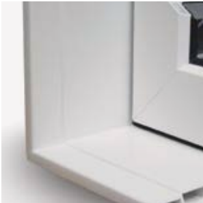
5 3/4" frame