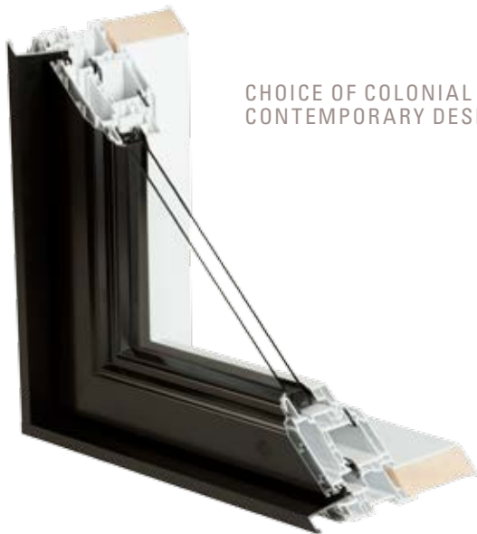
CHOICE OF COLONIAL OR CONTEMPORARY DESIGN